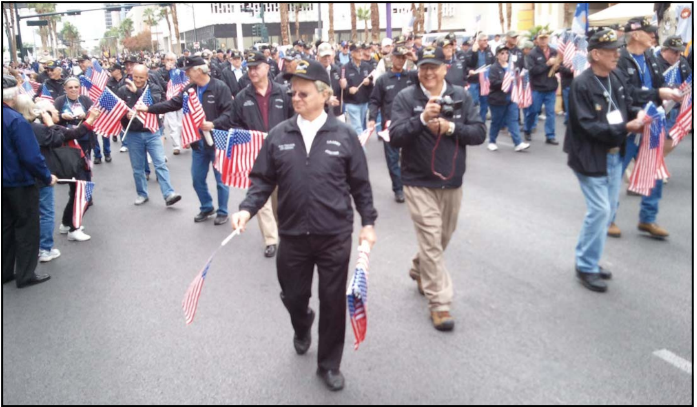
The Mohawk contingent marches in the 11-11-11 Veterans Day parade in Las Vegas.