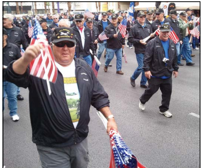
The Mohawk contingent passed out hundreds of American flags during the Veterans Day parade in Las Vegas.

Branson will have something to offer everyone who plans to come. We will attempt to schedule the reunion in September or early October so that weather is still great