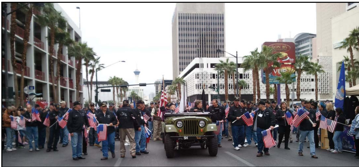
The Mohawk contingent marches in the 11-11-11 Veterans Day parade in Las Vegas.